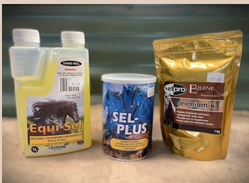
Selenium Products at Kiwi Seed

New Zealand soils are generally low in Selenium. In fact over 30% of farmland is deficient. Dietary supplementation is the only way to ensure adequate intakes. Cells need energy – energy to drive muscles, digest food, transmit nerve impulses. The byproducts of cellular energy production are waste products called peroxides. These are particularly important in the athletic horse, whose musculo-skeletal system demands a huge amount of energy. Unless the peroxides are neutralised muscle damage will occur.