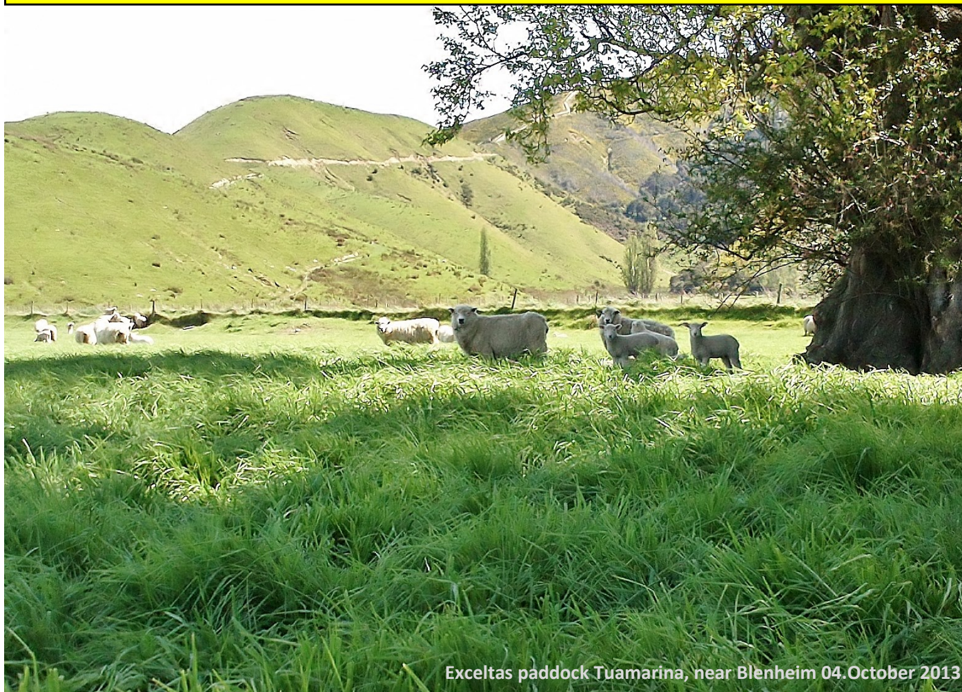
Exceltas paddock Tuamarina, near Blenheim 04.October 2013